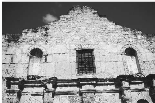
The Alamo - Texas's #1 visitor attraction.

some of the best Tex-Mex around. Cuisine options include American, Asian, BBQ, French, Greek, Indian, Italian, Tex-Mex, Seafood, Steakhouse and vegetarian. San Antonio is a shopper's paradise. With miles upon miles of local arts and crafts shops, outlet malls, galleries, unique gift shops and Mexican markets, it's easy to find great gifts.