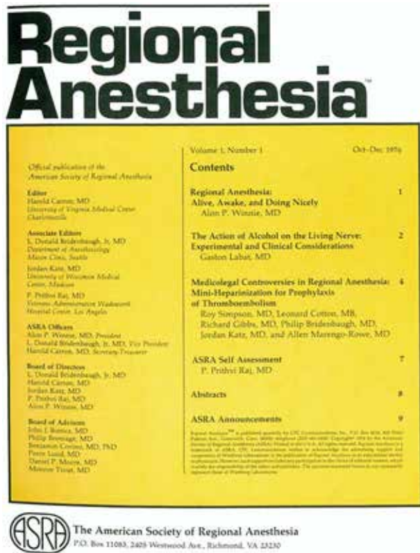
Fig 1. Title page of the inaugural issue of Regional Anesthesia .

that the 3 trunks of the brachial plexus are stacked, one upon the other, vertically above the first rib, as depicted by early anatomists, and not horizontally along the rib, as later renditions typically placed them. This concept formed the foundation for one of his greatest contributions to regional anesthesia: the subclavian perivascular technique of brachial plexus anesthesia.